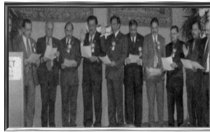
Author Taking Oath as President PCC USA

In the next two years, I plan to converge on the following few agenda items. However, I will always be seeking facilitation and guidance from all of you to dedicate my resources to support our business community.