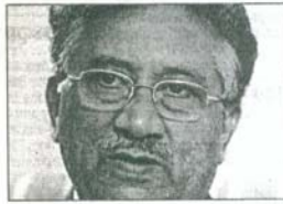
Musharraf: Pakistani general came to power through a coup eight years ago.