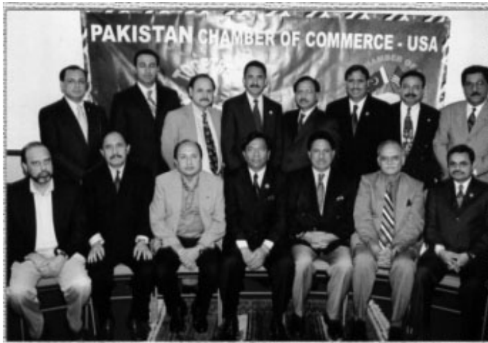
Author with Executive Board Pakistan Chamber of Commerce USA