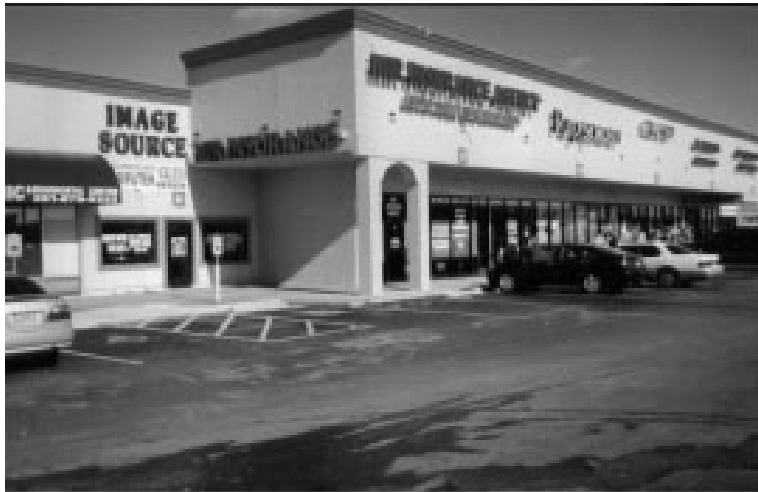
Pakistan American Community Centre